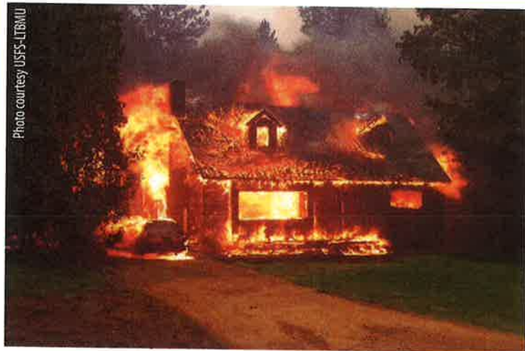
This house was ignited by burning embers landing on vulnerable spots. Notice the adjacent forest is not burning.

Maintain wooden fences in good condition and create a noncombustible fence section or gate next to the house for at least five feet.